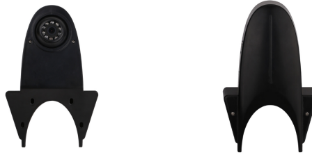
Rear view camera